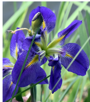
'Flareout', an early bloom.

Fri-Sun, Apr 15-17 Society For Louisiana Irises in Lafayette