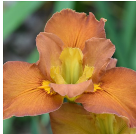
'Friends' Song' and 'Flaming Hot'

Come see how members use the irises in their landscapes.